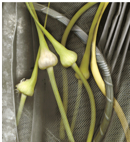
Kim Ellen Kauffman's "Weave" (2006), 16 in. x 21.5 in., archival pigment print. Edition of 15.

But the Four Photographers exhibit on view at Adam Cave Fine Art dispels this notion and demonstrates the tremendous varieties of emotive image-making that photography actually encompasses. Recent years have brought dramatic change to the medium: Digital cameras and printing techniques have fundamentally altered the way photography is done. With a foot in both the 19th and 21st centuries, this show succeeds by showing the contrast between digital techniques with more traditional methods and affording us a thumbnail glimpse of photography's past and present. Examples of time-honored, laborious photographic processes such as platinum printing and cyanotypes co-exist alongside C-prints and the latest digital technologies